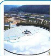
Commemorative Plaza The flow of the Kagawa Canal is depicted.