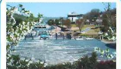
Water Plaza The water of the Kagawa Canal comes out to the ground from the tunnel.