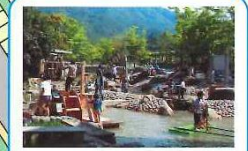
Jabujabu Pond A place for playing and enjoying contact with water