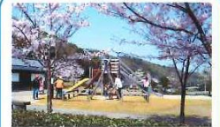
Flower Viewing Plaza Relaxing place with playground equipment

Enjoy a relaxing stroll around the park.